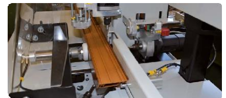
Pneumatic profile stops (left and right)