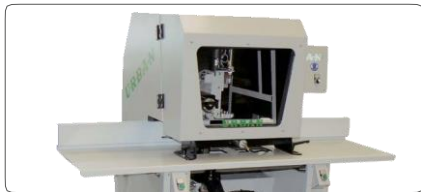
Option - sound insulating hood including gas pressure absorber for comfortable opening

The design highlight is the milling unit tilting in both directions; 20° each on top and 0 - 65° on the bottom. That's how door frames and sliding systems can be machined uncompromisingly. Enormous time saving is ensured by pneumatic side stops in conjunction with the lower milling unit