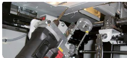
Drilling/milling unit from below with angle adjustment 0 - 65°