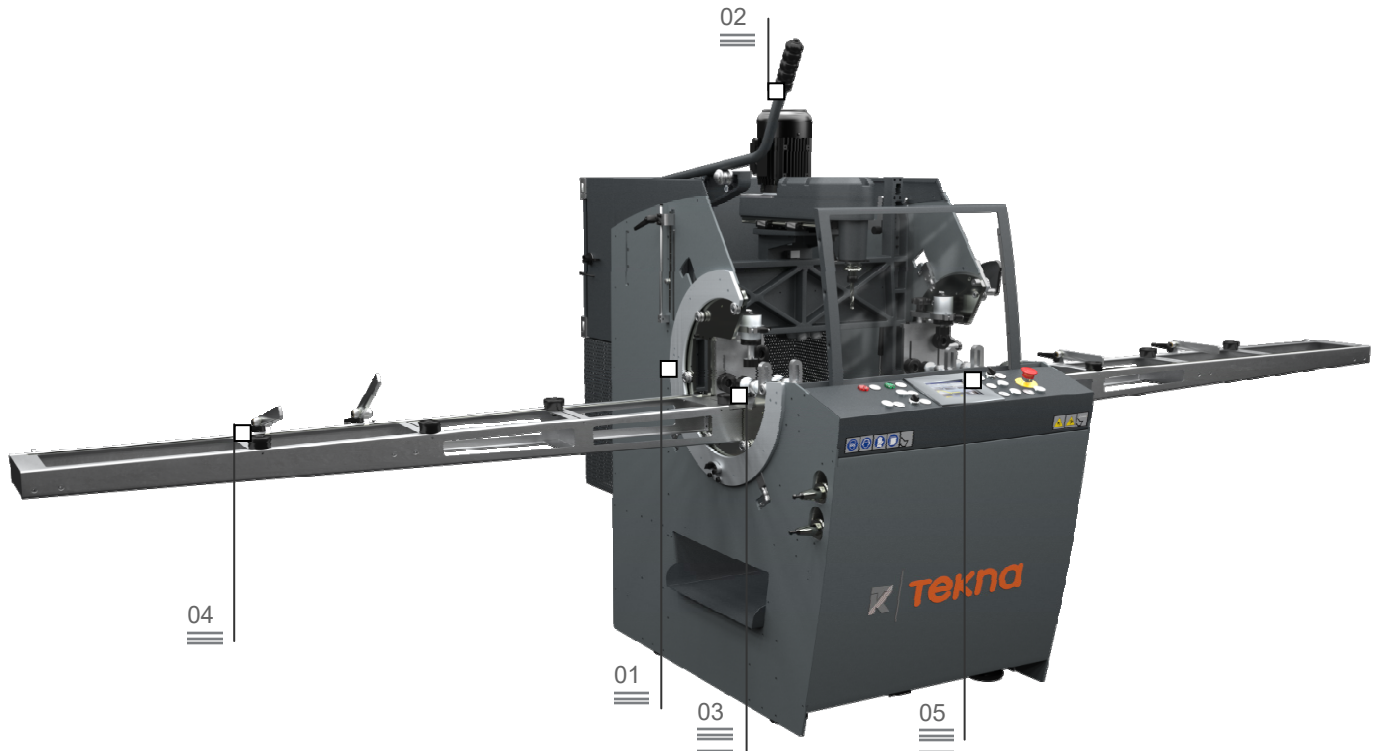
Control joystick 02

Copy router with 2 controlled axes, ideal for working aluminium, PVC and steel profiles up to 2 mm, with the possibility of working stainless steel (optional) up to 2 mm. Work cycle management takes place via intuitive software that guides the operator through simple indications on the touch screen display. The USB connection allows easy connection to the PC. The work table rotates on 4 sides and allows the implementation speed and precision to be increased. It also allows shorter tools to be used, thereby minimising through processing that cause vibration and noise. ISO 30 tool quick change. Work area pneumatic control protection.