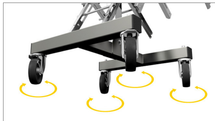
Swivelling castors 01