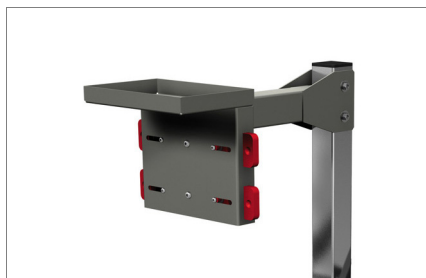
Reel locking clutch 03

A correct flow of materials, whether semi-finished or finished products, or parts in the assembly phase, plays an important role in rationalizing and optimizing the production cycle. The Emmegi Logistics line offers companies a concrete solution to all storage, handling and assembly problems. Spin 4 is a trolley for gaskets. A reel with clutch and wire guide ensures trouble-free gasket unwinding. It also has a quick roll change system.