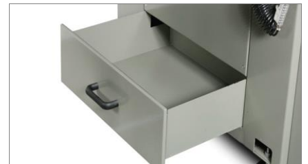
Swarf drawer 02