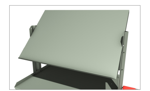
The pictures are provided by way of illustration only